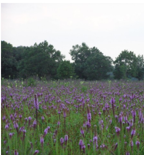
Liatris in bloom on the ABNC prairie

If you've heard of Prairie Friday or Stewardship Saturday and wondered what they are...here's the scoop.